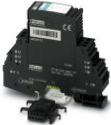
The figure shows the PT-IQ-1x2-24DC-UT version

Please be informed that the data shown in this PDF Document is generated from our Online Catalog. Please find the complete data in the user's documentation. Our General Terms of Use for Downloads are valid ( http://phoenixcontact.com/download )